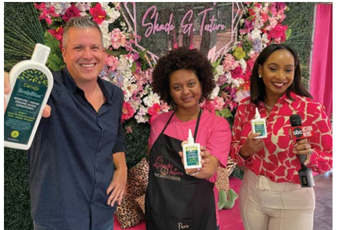
Canviiv (Cohort '24) secured a historic contract with the largest healthcare group purchasing organization in the USA.