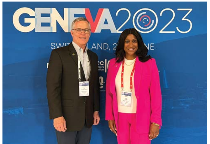
June - The Minority Business Accelerator was a finalist in the Best Chamber Model of Innovation category, competing with chambers from Turkey, China and Chicago.