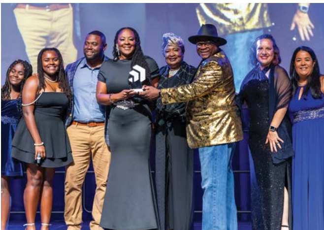
Paragon Cyber Solutions (Cohort '24) won Small Business of the Year in the category of 5- 20 Employees.