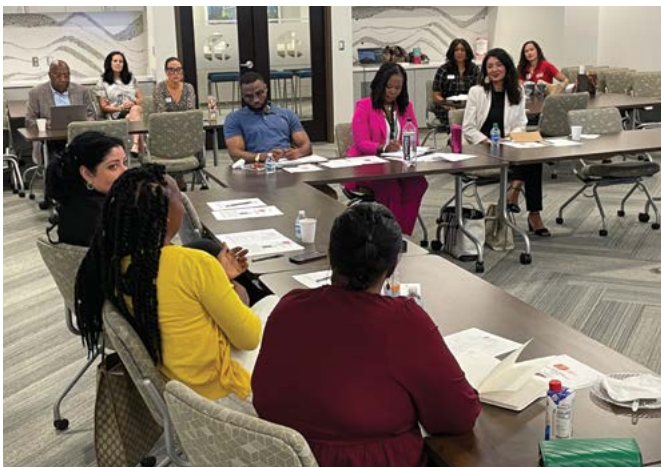
MEP entrepreneurs learned from subject experts at the Florida Small Business Development Center at USF.