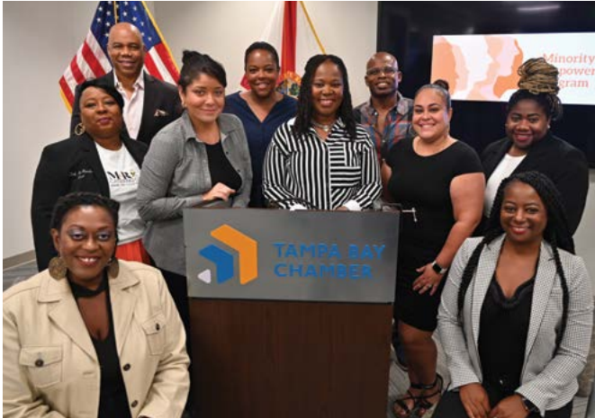
In addition to quarterly workshops, MEP entrepreneurs are connected to supplier diversity programs across the region.