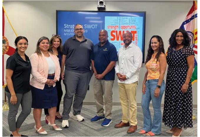
MBA Cohort '23 learned the power of S.W.O.T. - examining the Strengths, Weaknesses, Opportunities and Threats in their business.