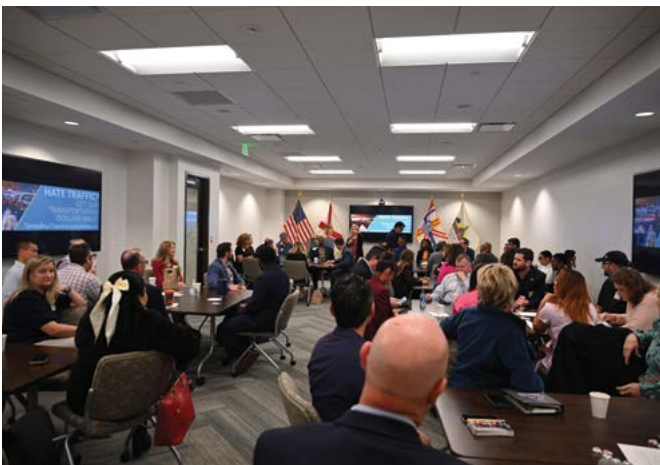
Coffee Connection - These quarterly events are hosted by the Chamber's Ambassador Committee.