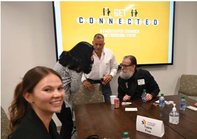
Get Connected in December was the last of 6 speed networking events in 2023.