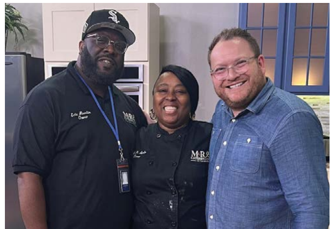
MEP 2023 graduate, M & R Café Southern Cuisine , went on to be profiled by Fox 13's local cooking show.