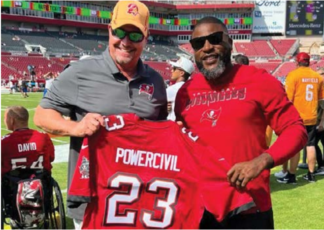
Our partnership with TECO and Tampa Bay Buccaneers continued in 2023. During each home game, a member of MBA Cohort '23 was spotlighted.