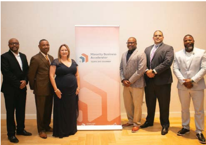
A proud moment for all six MBA entrepreneurs in Cohort '23 upon completion of their program.