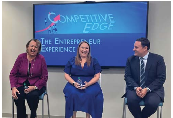
Competitive Edge: The Entrepreneur Experience in April featured business owners of Bay Food Brokerage , Ortega Custom Cabinets , and Willa's .