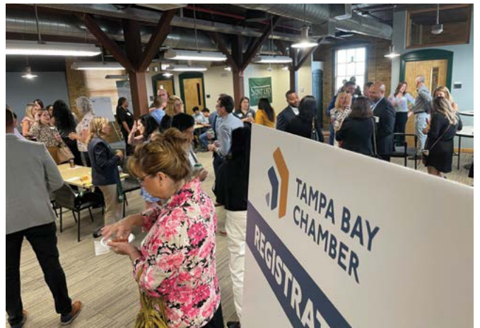
Tampa Bay @ Sunset in April brought members together at Saint Leo University's Tampa campus inside this former cigar factory in West Tampa.