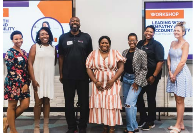
The Management Suite Workshop gave MEP participants insightful information on leadership.